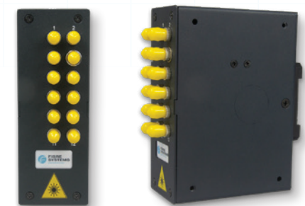
Compact DIN Loaded with ST Singlemode Adapters