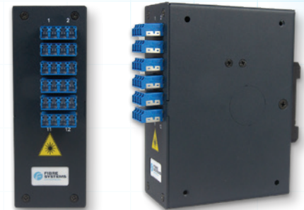
Compact DIN loaded with LC Adapters with Internal Shutters