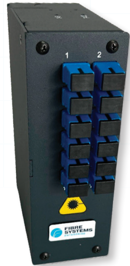
Compact DIN loaded with SC Adapters